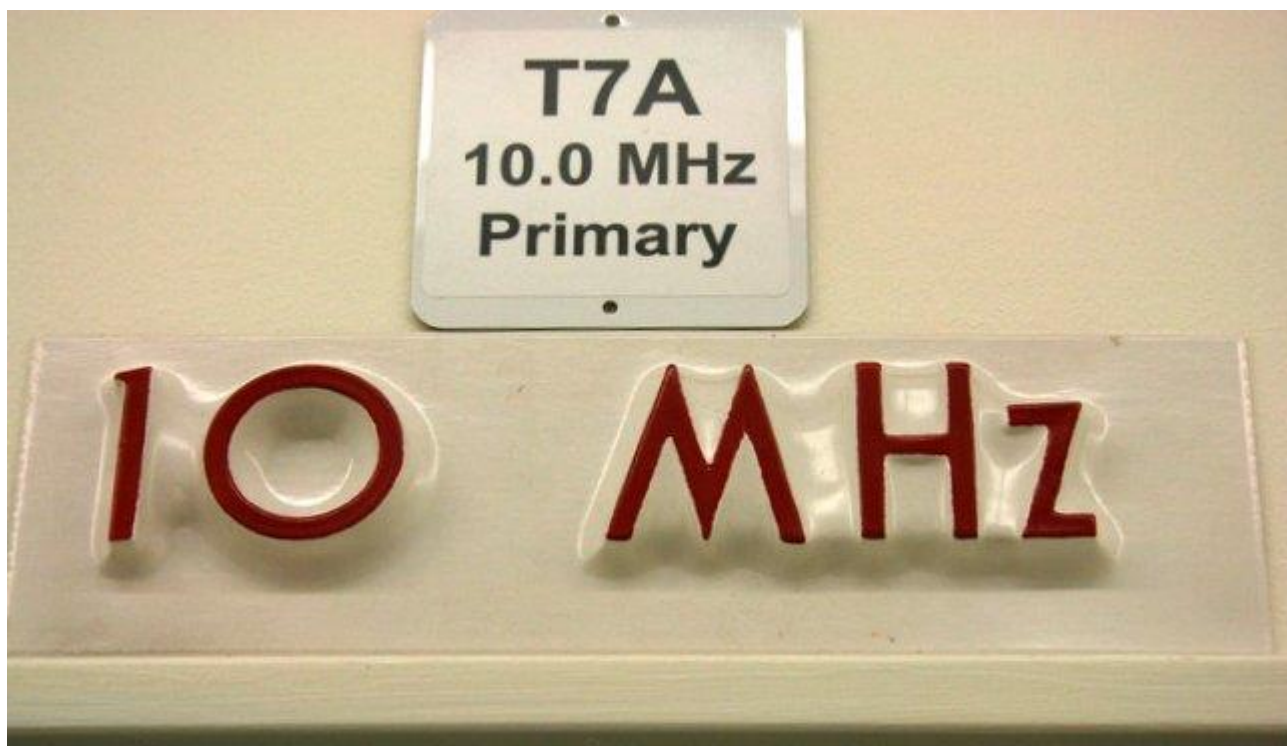
Photo Thomas (K4SWL) took in 2014 of the sign above WWV's primary 10 MHz transmitter.

Both stations have voice announcements. WWV uses a male voice; WWVH, a female voice. They are staggered in time so that they don't talk over each other. While doing research for this blog, one afternoon on 5 MHz and 10 MHz, I could hear the female voice, followed by the male voice, so I was hearing both Hawaii and Colorado. On 15 MHz, I could hear only Hawaii. Both stations transmit in AM mode, although I sometimes use upper sideband to pick the signals out of the noise.